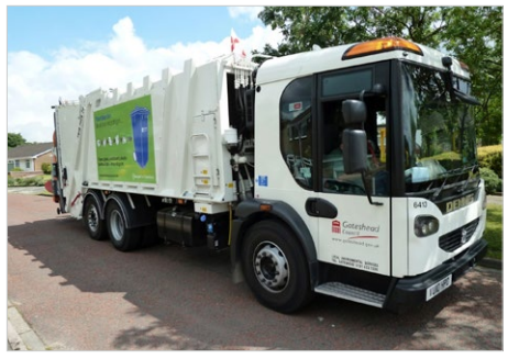
Service vehicle numbers were reduced, leading to a reduction in carbon emissions.